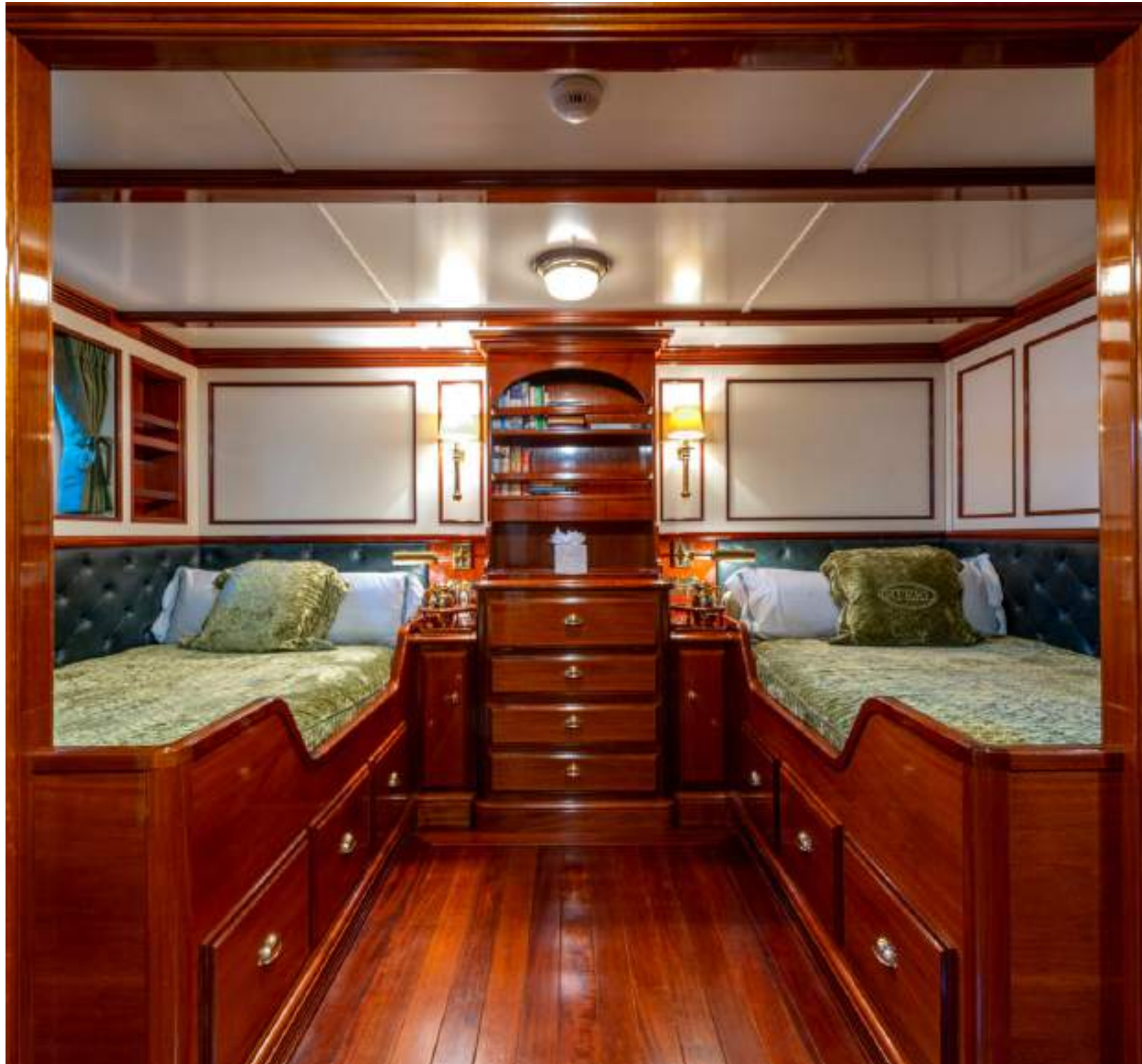
The layout supports both family use and mixed groups.

STEEL accommodates up to 12 guests across seven cabins, allowing for a variety of arrangements.